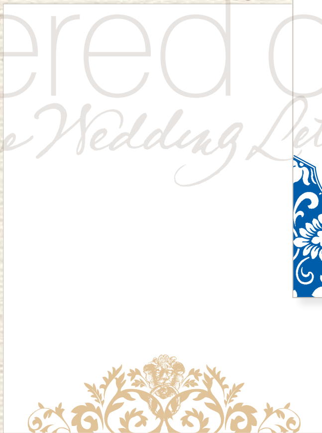
Folded Table Number