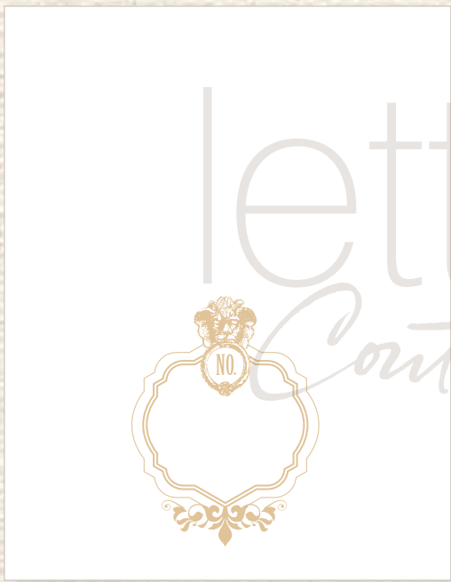
Folded Butler Card