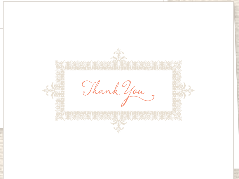
Folded Notecard & Envelope