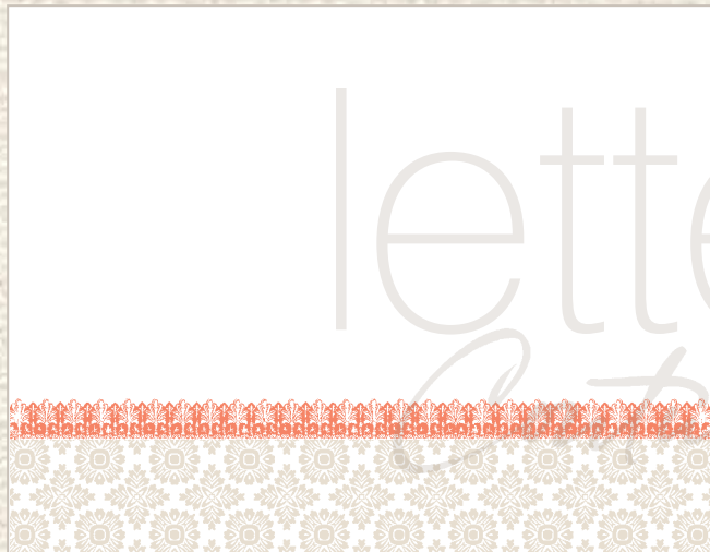
Folded Butler Card