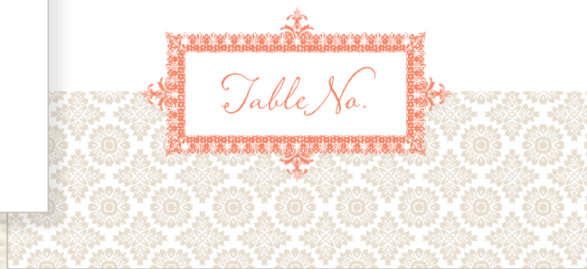
Folded Table Number